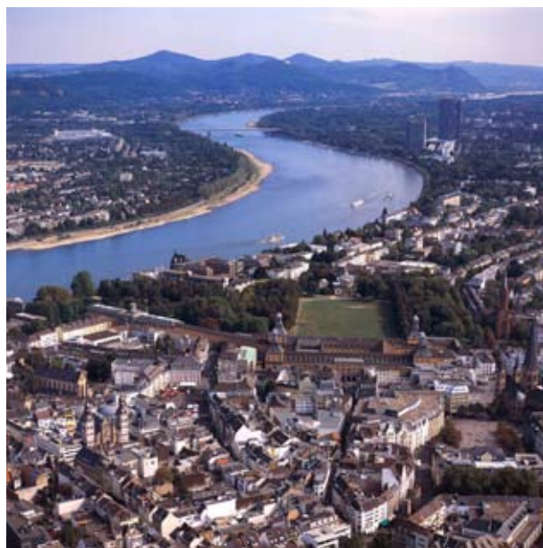
Aerial view of the City of Bonn and the Rhine River which flows through it

Situated in one of central Europe's biologically diverse landscapes, Bonn and the Rhineland have a long tradition of nature conservation. With a dense and growing population, Bonn must take a sensitive approach